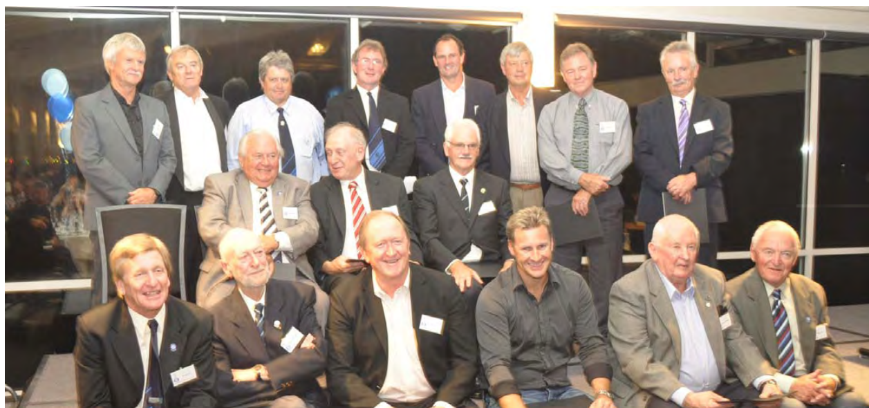
N&CCC Centenary team photo members