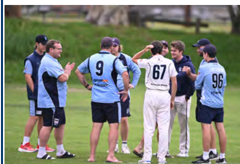
The 2nds enjoyed a solid win